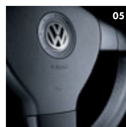
06 Leather trimmed steering wheel.

● Standard equipment ○ Optional equipment – Not available Factory-fitted options are subject to availability and extended delivery.