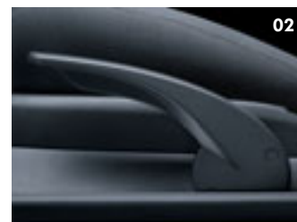
02 Driver's and front passenger's seat height adjustment.

The importance of comfort and convenience cannot be over-emphasised. Choose from this range of factory-fitted options to create an interior that meets your individual needs, and makes life just that little bit more comfortable and convenient. From 'Climatic' semi-automatic air conditioning to a Winter pack, these essential luxuries are designed to help you relax and take the stress out of driving, adding not only a touch of luxury, but also providing invaluable practical assistance.